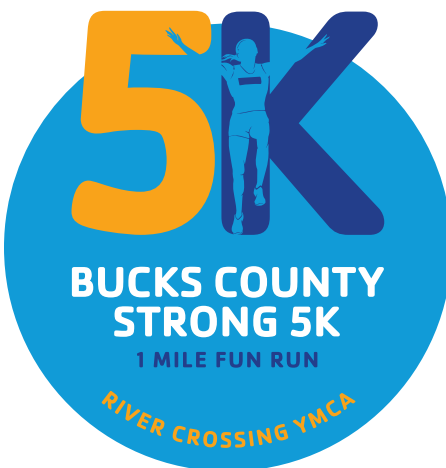
NEW MEDAL DESIGN

STRONG is in our name and it takes 100+ volunteers to bring our YMCA Bucks County Strong 5K runners, walkers and ruckers across the finish line.