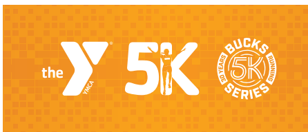
NEW RIBBON DESIGN