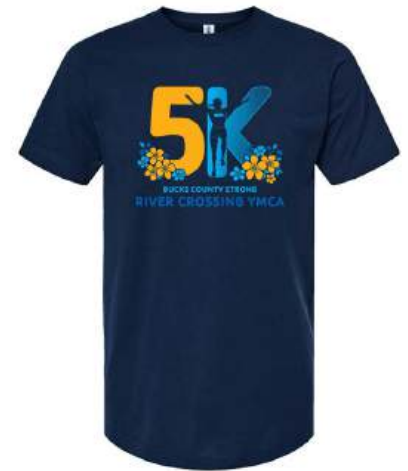
NEW SHIRT DESIGN